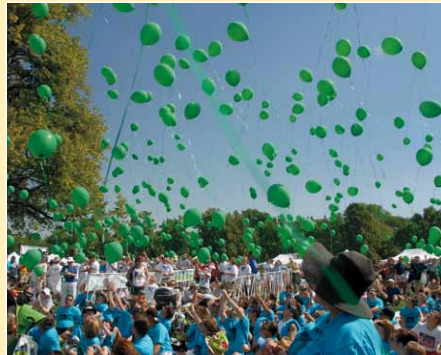
At the Donor Dash, families release balloons to honor donors, celebrate recipients and recognize those still waiting for transplants. The annual event is hosted by Donor Alliance in Denver, CO.

We welcomed a new Recovery Partner: University of Texas Health Science Center, San Antonio/Allograft Resources.