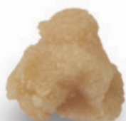
AlloFuse® DBM Putty