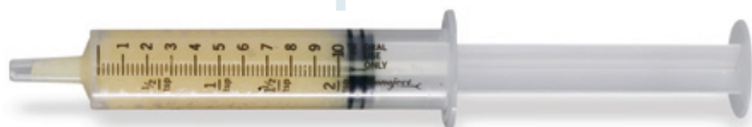
AlloFuse® DBM Gel