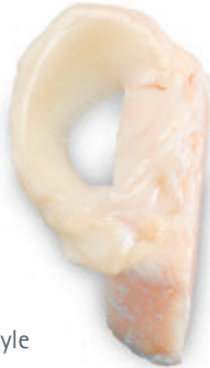
Femur – Hemi-Condyle