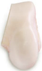
Femur – Hemi-Condyle